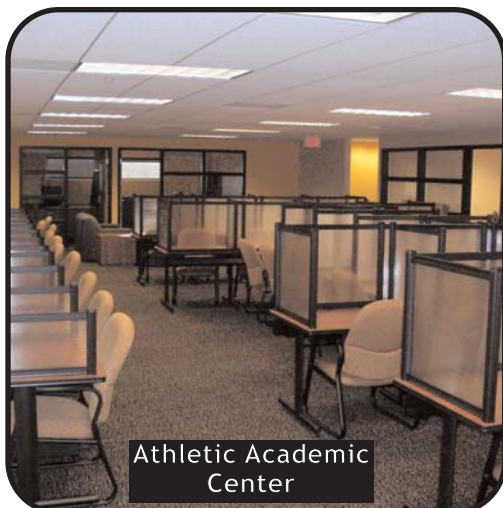
Athletic Academic Center

Phase three of the renovations is underway with the swimming and diving locker rooms and the UMBC Tennis Complex. The new varsity locker rooms for the swimming and diving team have been increased in size and equipped with a suit dryer and brand new lockers for the student-athletes. The UMBC Tennis Complex behind RAC Arena, to be finished in the Spring of 2005, will see the addition of two new courts to bring a total of eight courts to the center, lights, bleachers for spectators and a new patio allowing UMBC the potential to host night tennis, tournaments and expand camp programs.