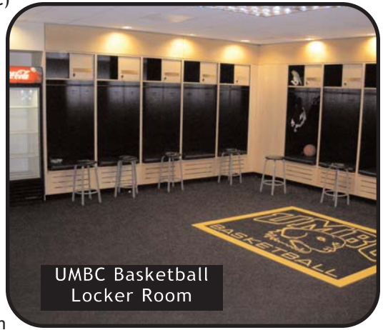
UMBC Basketball Locker Room

The men's locker room, which is located at the far end of the arena, features full length wood lockers, bathroom and shower facilities a separate coach's Locker room area and entry way. The entire facility is equipped to have plasma and projection TV's and a sound system to provide the athletes with the comforts of home. In addition, a new media center/team film