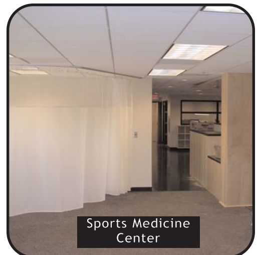
Sports Medicine Center